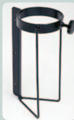
O 2 tank holder

Suggested recliner configuration based on most popular features and options for this application at time of printing. Many features and options available. See your Champion representative for more information. Champion reserves the right to make changes without notice in design specifications and models.