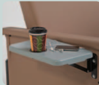
2nd fold-away side table w/cup holder