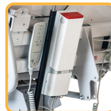
On-Board Charging Lithium-ion Battery